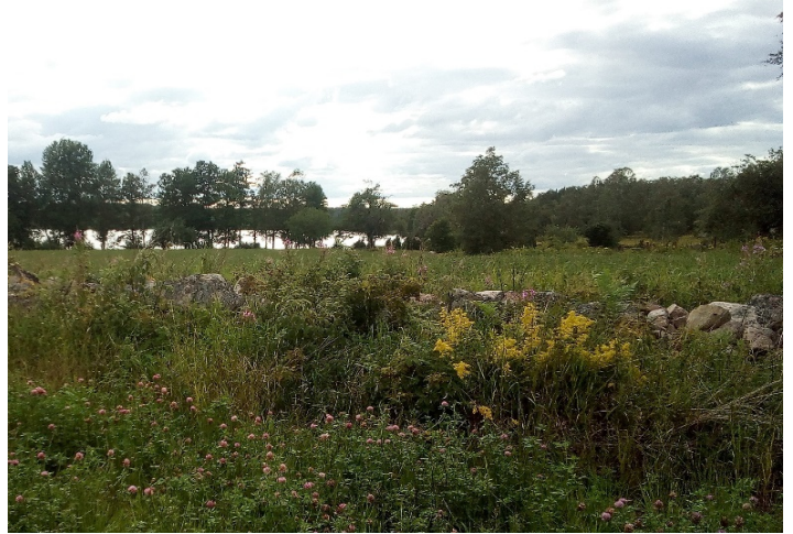
Stone Fence in Sweden