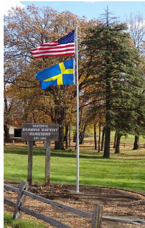
New telescoping Flagpole and relocated wooden sign at the NW Point of the Cemetery.

Thanks to Picture Perfect Landscaping for their reasonable cost estimate and timely work. Thanks to the Island View Golf Course for storing the new flagpole for almost a year. We honor our courageous ancestors by continuing to care and enhance their final resting place.